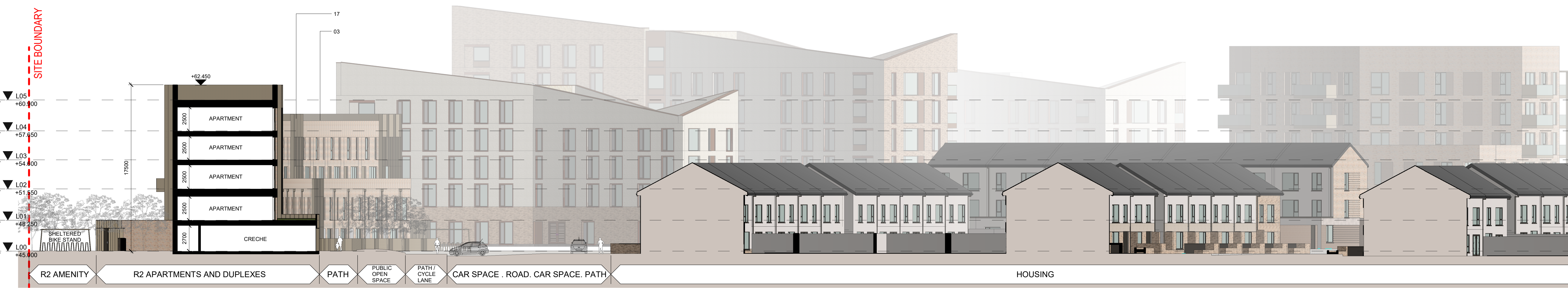
2 SECTION BB 3010 SCALE 1 : 200